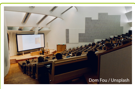
Zoom in on... Zoom in on... SAPIEN'S Advance training courses

The Sustainability and Procurement in International, European, and National Systems (SAPIENS) Network develops and offers Advanced Training Courses for early-stage researchers and practitioners.