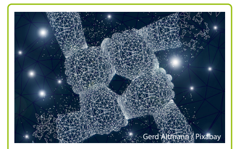
Zoom in on... Barcelona: Agreement to include social clauses in public procurement

On December 3, the city of Barcelona, through the Directorate-Administrative Contracting Coordination and the Municipal Institute for Persons with Disabilities, together with the Forum for Socially Responsible Procurement, signed a collaboration agreement to promote the inclusion of new social clauses in public procurement that encourage accessibility and the social and labour integration of people with disabilities.